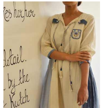
OH/32/19 : Classic Blue ombre organic cotton tunic with botanical embroidery