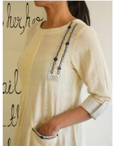
OH/38/19 : Classic Blue ombre organic cotton long kurta with cord embroidered side placket and from pleats.