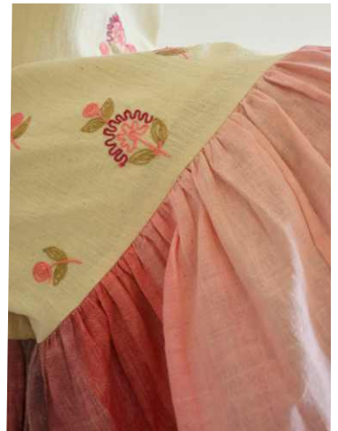
OH/37/19 : Pink Purple ombre organic cotton gathered long dress with botanical embroidery