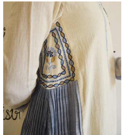
OH/31/19 : Classic Blue ombre organic cotton long dress with botanical embroidery