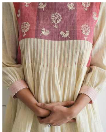
OH/36/19 : Purple Pink ombre organic cotton top with botanical embroidery