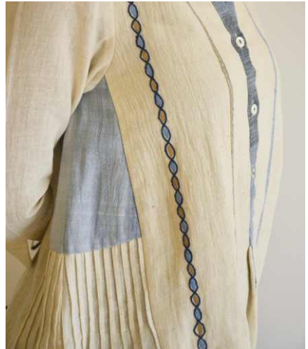
OH/33/19 : Classic Blue ombre organic cotton top with front full of cord embroidery