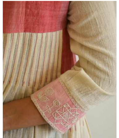
OH/35/19 : Purple Pink ombre organic cotton pleated tunic with cord dori embroidery